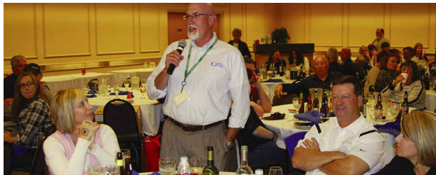
Example of "Vendor Appreciation", the giving of a short speech to the group after dinner via wireless mic.

The Marriott NW is the former Northland Inn. It is the tall hotel that you can see from I-694.